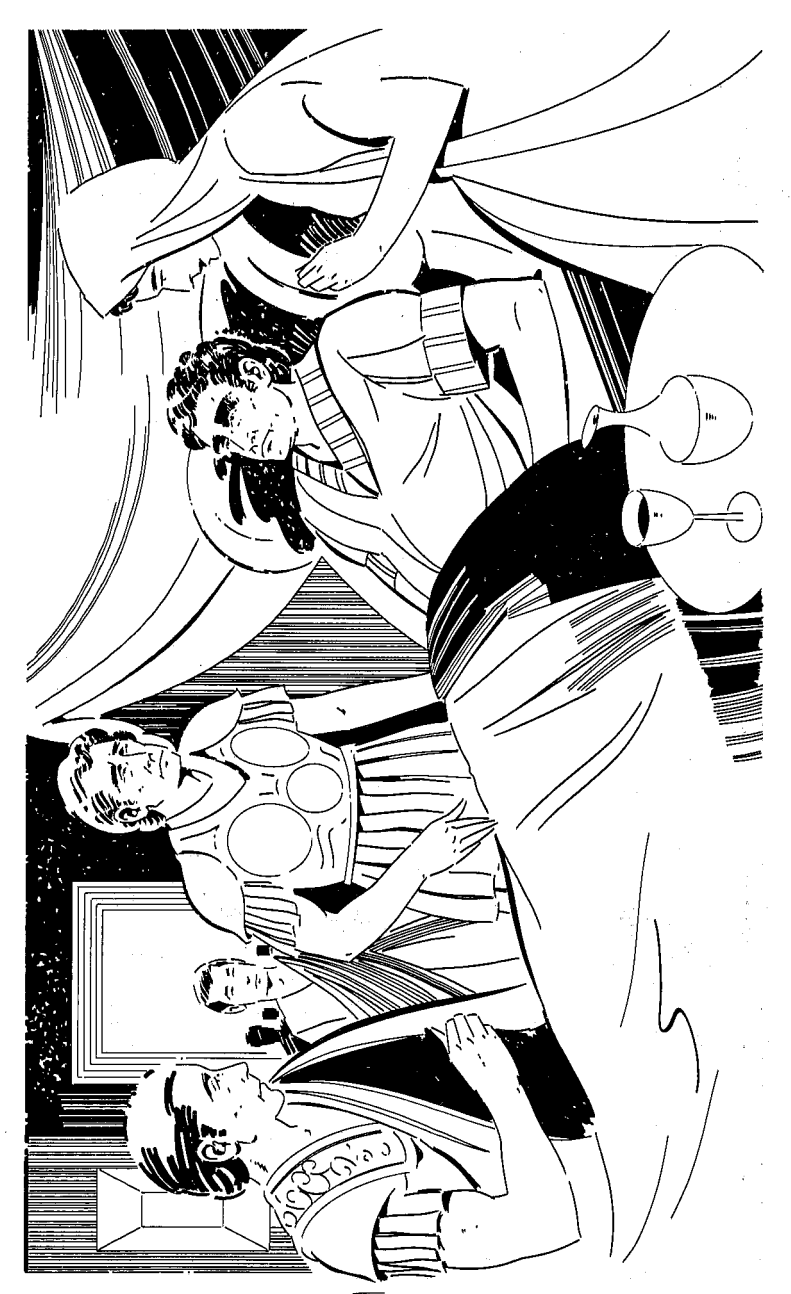
The Death of Alexander the Great 300