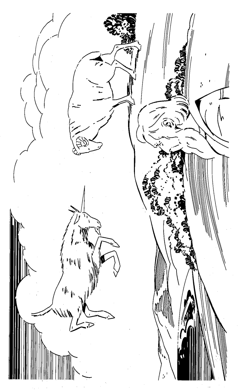
The Ram and the He-Goat 298